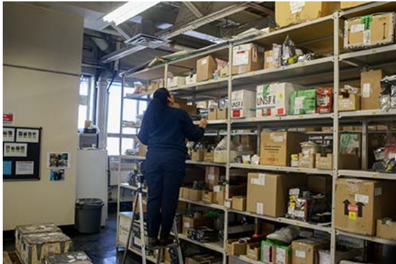
Searching standard shelving

Reduction of search time. Once an associate arrives at a pick face, time must be spent searching the racks or shelves visually to locate the correct item, then verify the stock keeping unit (SKU) and required quantity. Conversely, automated storage and retrieval solutions are equipped with light-directed systems that highlight the item's location and quantity required for picking (or replenishment), eliminating search time and boosting accuracy.