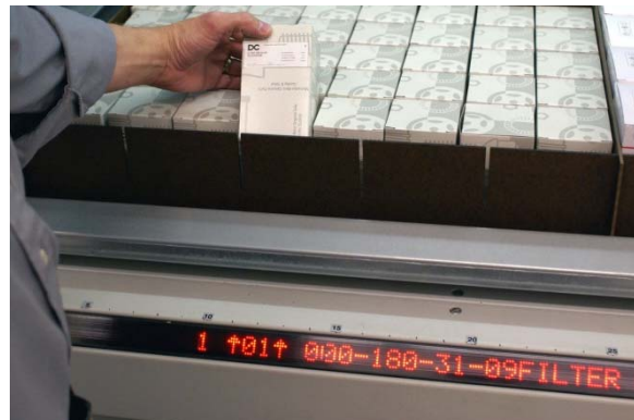
Pick to Light TIC (Transaction Information Center)

Error prevention. Because manual picking operations rely solely on the picker's decisions and actions to fill orders correctly, the opportunity for human error is significant. Resulting costly mispicks can be attributed to the wrong item or quantity being chosen, omissions and oversights, or selection of damaged or mis-labeled items. 8 In addition to indicator lights, automated storage and retrieval systems feature integrated message centers that communicate pick information to the operator. Together, these systems indicate the precise location within the carrier of the item to be picked, display the part number or description, and specify the required quantity. They can also show a photo image of the required item, giving an operator clear visual cues that can help to verify the correct item has been picked.