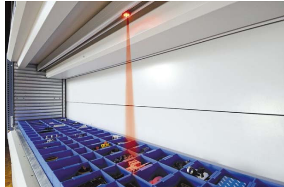
Light directed picking

Error prevention. Because manual picking operations rely solely on the picker's decisions and actions to fill orders correctly, the opportunity for human error is significant. Resulting costly mispicks can be attributed to the wrong item or quantity being chosen, omissions and oversights, or selection of damaged or mis-labeled items. 8 In addition to indicator lights, automated storage and retrieval systems feature integrated message centers that communicate pick information to the operator. Together, these systems indicate the precise location within the carrier of the item to be picked, display the part number or description, and specify the required quantity. They can also show a photo image of the required item, giving an operator clear visual cues that can help to verify the correct item has been picked.